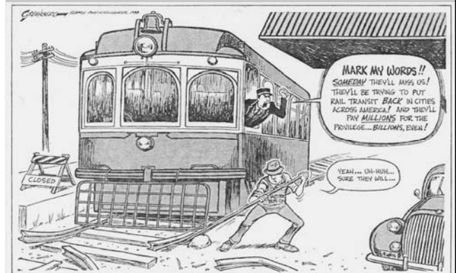
Cartoon by Steve Greenberg, reprinted courtesy of The Seattle Post Intelligencer.

Dec-May: By appointment - (425) 744-6478