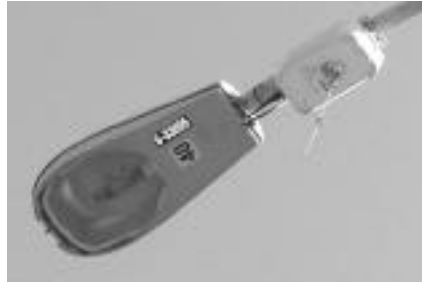
The streetlight number can be easily seen from the street on the bottom part of the fixture.

■ The nearest address to the malfunctioning streetlight.