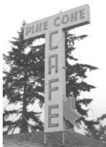
Longtime Lynnwood business going strong.