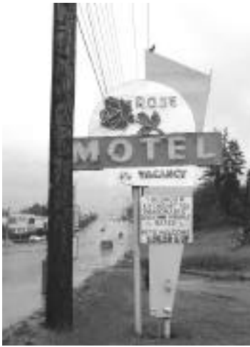
Lynnwood property makes way for Lexus dealership.