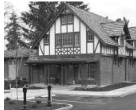
The historic Wickers Building will house the Snohomish County Visitor Information Center.

The first phase of development was funded with a combination of federal, state and local funds that included a Federal Gas Tax grant, Washington State Heritage Capital Projects grant, Hotel/Motel funds and City of Lynnwood Capital Development funds.