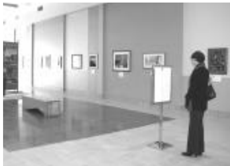
The exhibit is at the mall's southeast entrance.

This is a win-win-win situation for all parties involved. Artists get a great space to show their work; Alderwood gets to