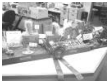
The project "The Salmon's Revenge!" was a ribbon-winner at the flower and garden show.

Spruce Primary was a recipient of a Surface Water Education Grant from the City of Lynnwood. Each year the City provides the opportunity for local schools to receive grant monies to complete projects about surface water education.