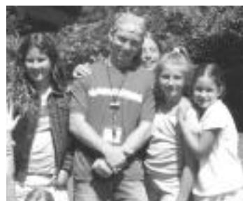
Positions are available for summer camp counselor at Camp Kookamunga and Camp We-Wanna-Go.

Applications are available at 19100 44th Avenue West in Lynnwood. For more information call (425) 775-1971 or visit www.ci.lynnwood.wa.us . Applicants who need accommodation during any part of the application or interview process should call the Human Resources Department at (425) 670-8316. EOE