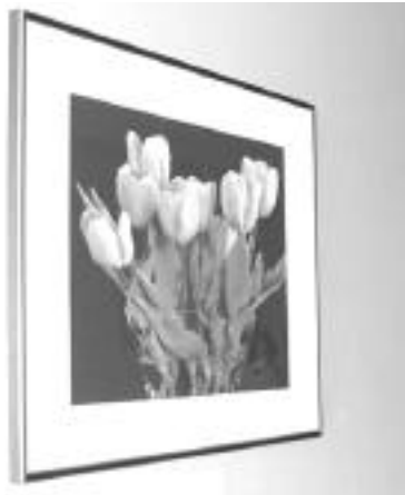
Artwork on display at Alderwood Mall.

The convention center features artwork from over a dozen nationally and internationally acclaimed artists. Oil and acrylic paintings, handmade paper, Japanese paper cuts, wood-carvings and fiber art dress the walls as people explore the brand new facility. Each piece celebrates the artists’ culture, heritage and traditions.