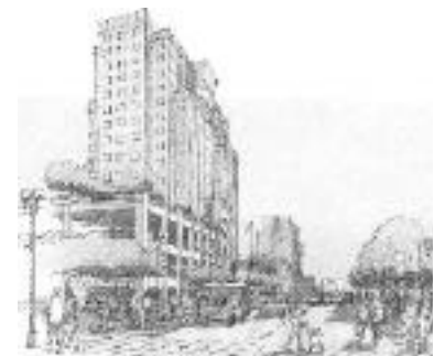
Artist's rendition of City Center

The ordinances and additional City Center documents are available at the City's website by typing the following URL into your browser window: http://www.ci.lynnwood.wa.us/Content/Business.aspx?id=72