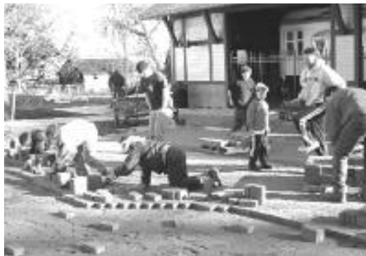
Volunteers place bricks in Heritage Park plaza.

Lynnwood Rotarians and their families devoted two weekends to lay 5,000 bricks in the Heritage Park plaza, 250 of which are inscribed. Additional inscribed bricks can be ordered for the second installation in the plaza. Order forms are available at City Hall, the Visitor Information Center, on the City website, www.ci.lynnwood.wa.us , or by calling 425-744-6478.