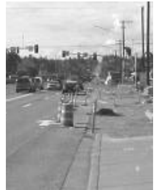
Right turn lanes are being added to 44th Ave. W.

Project updates will be posted weekly on the City's website at www.ci.lynnwood.wa.us , Public Works: 44th Avenue West Improvement Project Updates. You may also contact Les Rubstello at 425-670-6262 ( lrubstello@ci.lynnwood.wa.us ) for additional information.