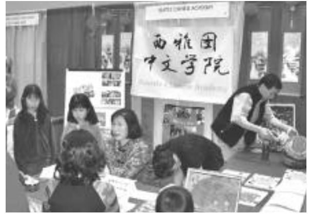
Fair-goers engaged in cultural arts and crafts activities.