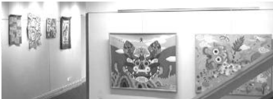
Some of the artwork on display at the Lynnwood Convention Center.