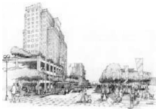
The model drawing shows a City Center with taller buildings downtown (up to 25 floors), new housing and pedestrian plazas.