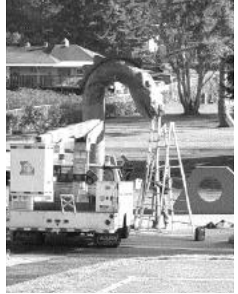
City workers install the repaired Dragon.

On February 10, he was put back together, and he is once again observing all who enter his domain. Stop by North Lynnwood Park and say hi! North Lynnwood Park is located on the west side of 44th Ave. W. at 185th St.