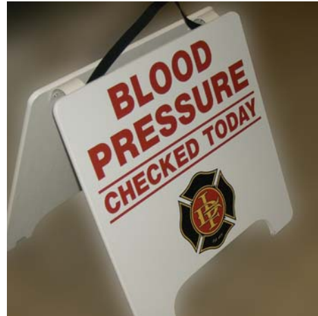
Typical A-Board sign. When you see sign in front of Fire Station 15, stop in for a free blood pressure check

About movable double-faced or sandwich boards, code specifies: