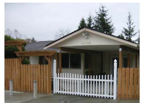
One of many adult home care locations in Lynnwood

Learn more about how you can become an ombudsman by calling program representatives at 425-388-7393 (Snohomish County) or 1-800-562-6028 (Washington State). ❖