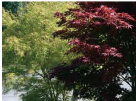
Both Japanese Maples, but strikingly different in color