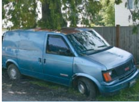
Abandoned junk vehicle ci.lynnwood.wa.us .

Lynnwood's Municipal Code contains basic standards for maintaining property in an acceptable manner. Building and Fire codes provide standards to protect life safety and property. Zoning Codes define acceptable uses in each zoning district. For example, there are significant restrictions on commercial businesses operating from residential neighborhoods. The Nuisance Code defines acceptable standards in a variety of areas such as excessive noise, vermin, vegetation blocking public sidewalks or views of traffic, refuse, junk or excessive vehicles and similar matters. You can access the entire city code online through the website at www.ci.lynnwood.wa.us .