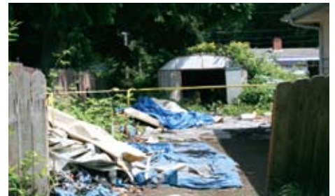
Trashed and abandoned

The Code Enforcement staff is ready to answer your questions, discuss situations of concern and respond to code violations. When a complaint is received, a staff member first determines what, if any, violations of code exist. The next step is to contact the property owner and seek voluntary compliance. Voluntary is the preferred method over involuntary measures. If voluntary fails, enforcement tools include issuing citations with associated fines and/or requirements to appear in court, other means of assessing fines and, even obtaining court orders to allow the city to resolve a situation at the owners expense.