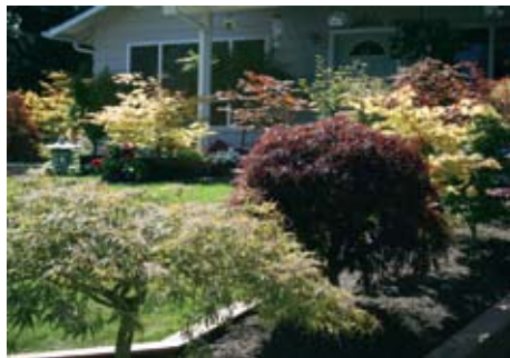
The front lawn is surrounded by maples